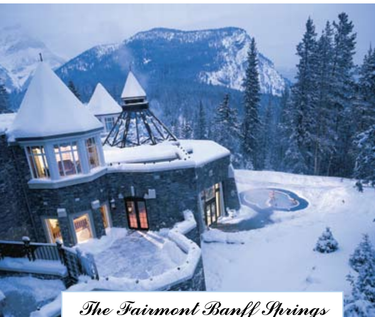
The Fairmont Banff Springs