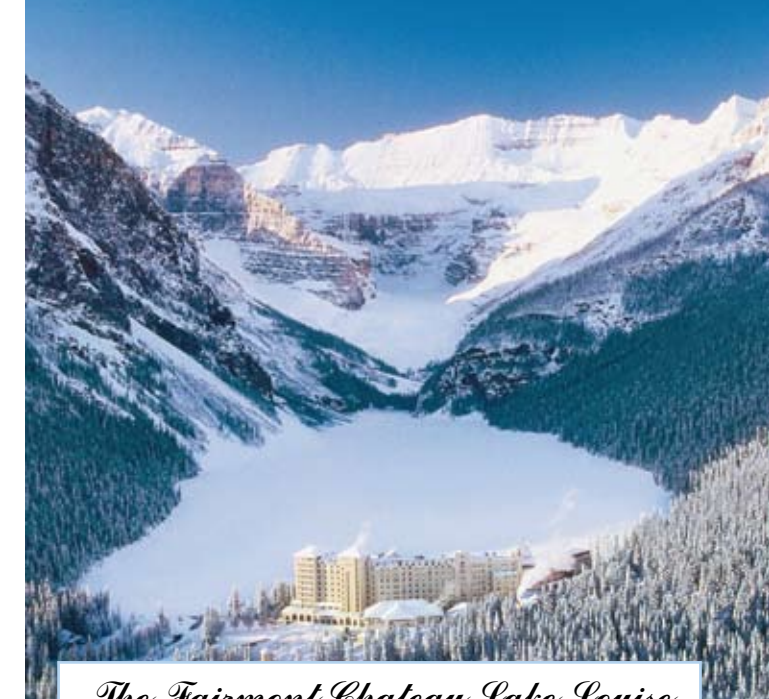
The Fairmont Chateau Lake Louise

Winter activities are abundant in this winter wonderland. As one of Canada's largest ski resorts spread across three mountains, downhill skiing is king. But guests can also take part in heli-skiing, snowshoeing, dog sledding, cross-country skiing,